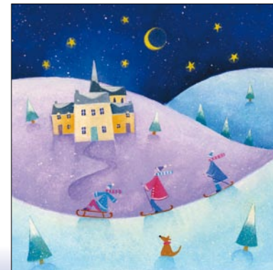
Moonlit Night Size 140mm x 140mm Price per pack of 10 cards £4.00