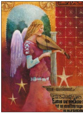
Angel Playing the Lute Size 103mm x 144mm Price per pack of 10 cards £3.50

With Best Wishes for Christmas and the New Year