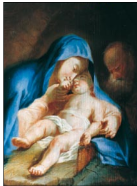
Madonna and Child Size 103mm x 144mm Price per pack of 10 cards £3.50