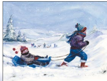
Winter Playground Size 144mm x 103mm Price per pack of 10 cards £3.50