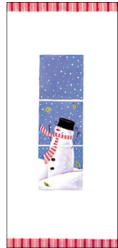
Winter Snowman Size 84mm x 185mm Price per pack of 10 cards £3.75