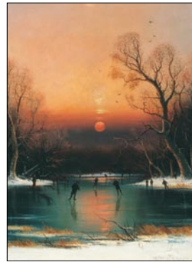
Skating at Sunset Size 103mm x 144mm Price per pack of 10 cards £3.50